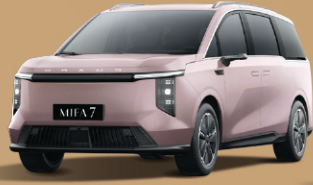
暮光粉 [5A26] (Twilight Blush)