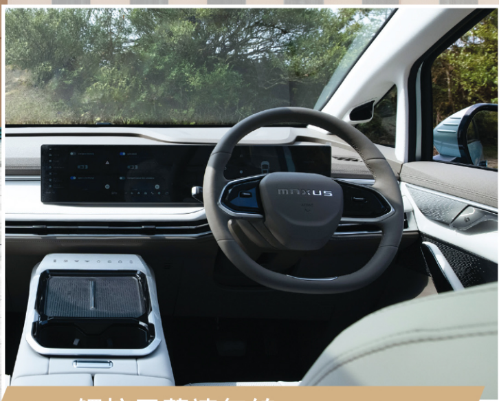
12.3 觸控屏幕連無線 Apple CarPlay