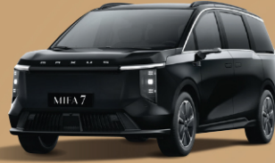
曜石黑 [F081] (Metal Black)