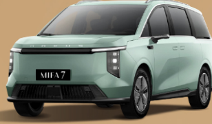
冰翠綠 [5A25] (Emerald Green)