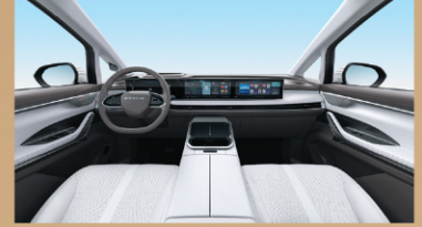
雲舒白雙色 Cloudy White