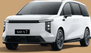
珠光白 [5A2D] (Pearl White)