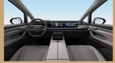
可可棕雙色 Choco Brown