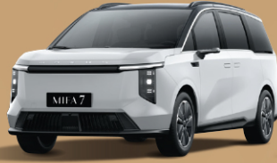
黑/隕石灰 [5A2C] (Concrete Grey/Black)